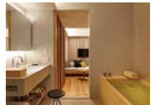
Premier Double (with hinoki bath)