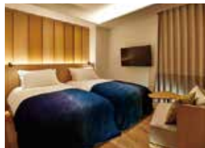
Deluxe Twin (with hinoki bath)