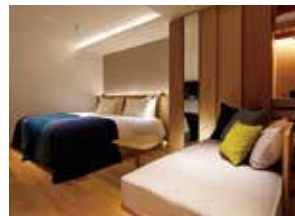
Premier Twin (with hinoki bath)