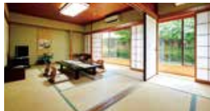
Japanese Room (10 + 4 tatami mats)