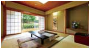
Japanese Room (8 tatami mats)