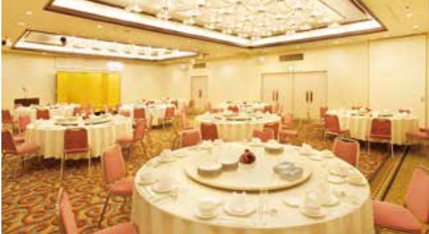
2F Royal Prince

We are able to cater to the needs of our guests for any occasion, from elegant banquets to casual parties. In addition to the banquet room, there are also four meeting rooms available for use.