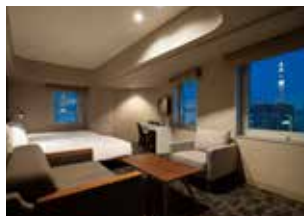
Premium Sky Twin