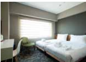
Premium City Twin