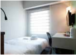
Standard Semi Double